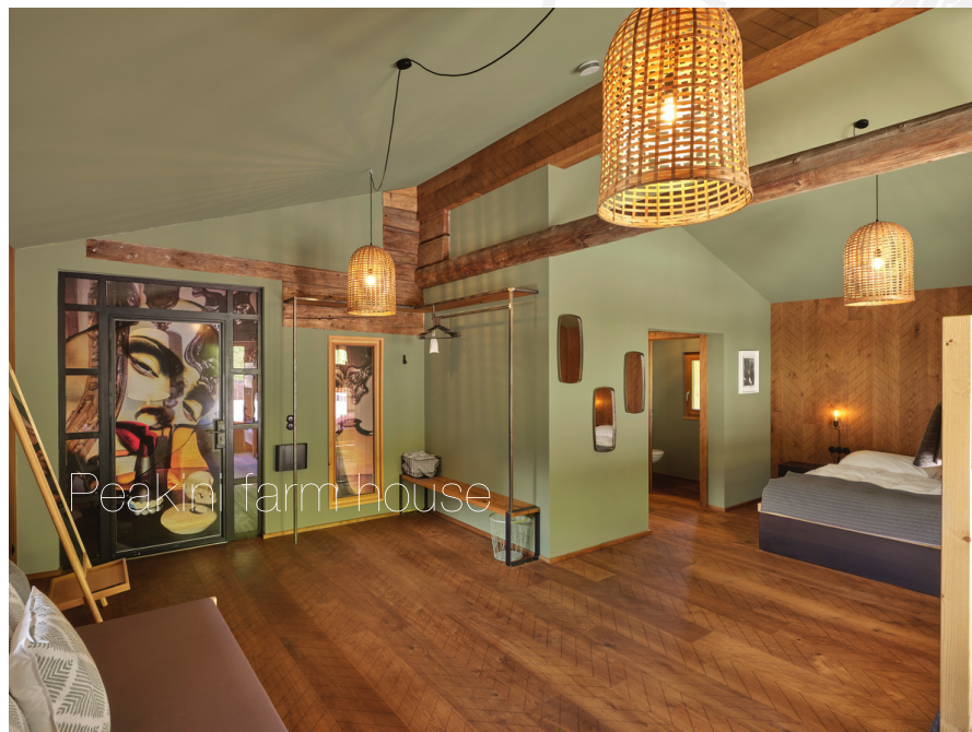
Peakini farm house