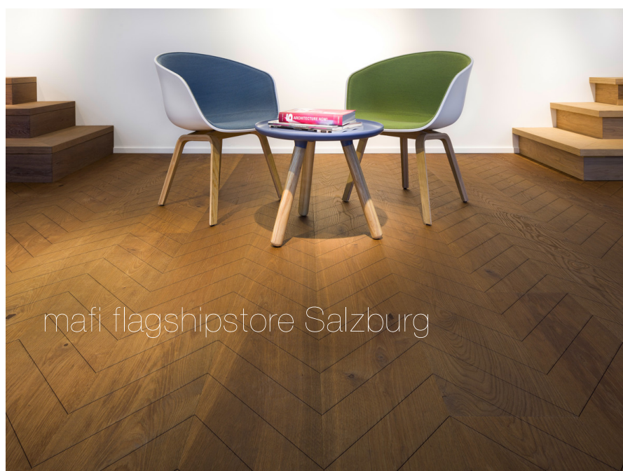
mafi flagshipstore Salzburg