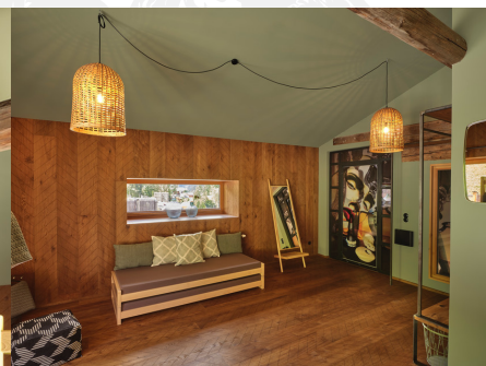
Peakini farm house 5561 Untertauern Austria